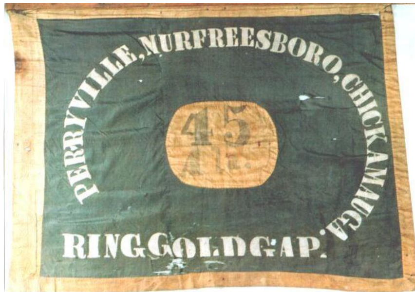
45th Alabama Infantry Regiment