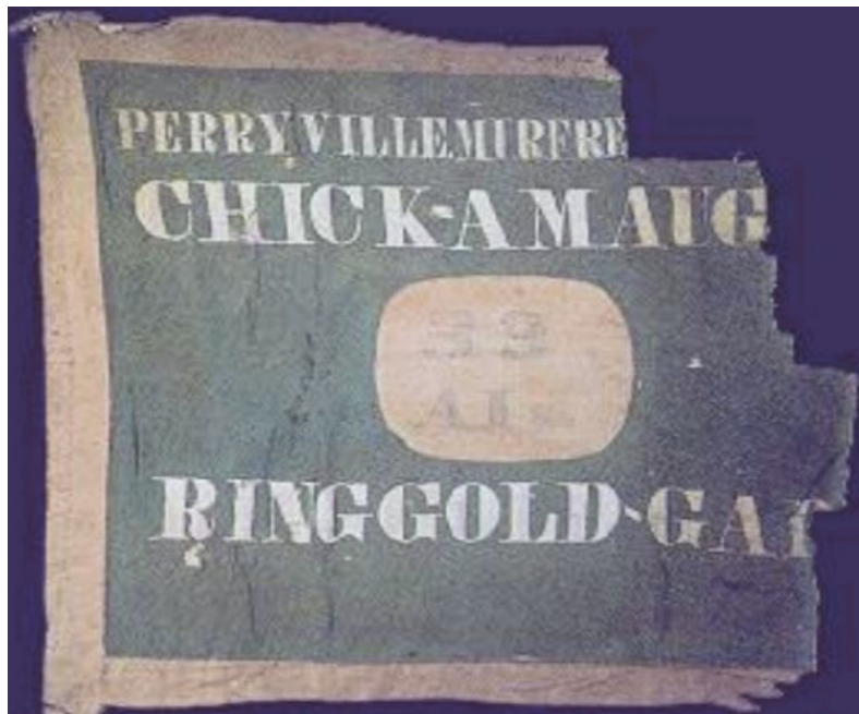
33rd Alabama Infantry Regiment