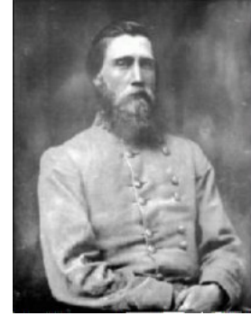
General John Bell Hood