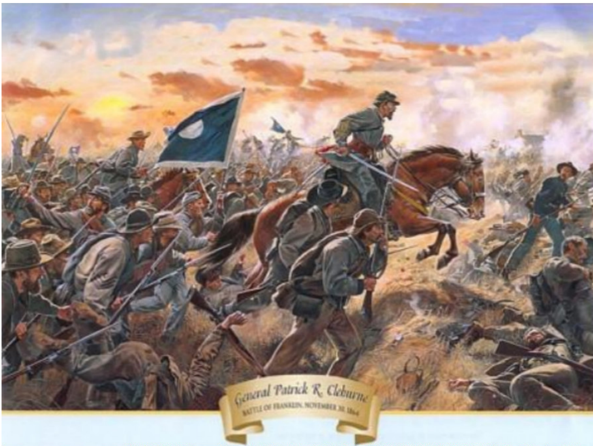
"General Patrick R. Cleburne, Battle of Franklin, November 30, 1864" by Civil War artist Don Troiani