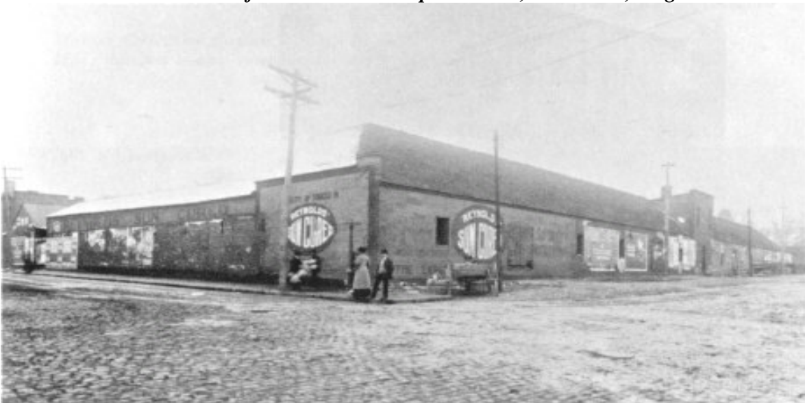
Known as "the billboard of Richmond" because it was always well "papered" with show and circus sheets, announcements, and political placards. (Post war photo and Hospital No. 9 information courtesy of Civil War Richmond, Inc., copyrighted @ 2004)