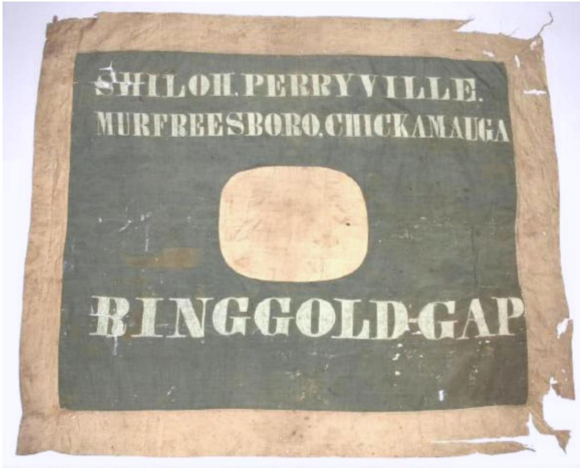
Hardee/Cleburne 1864 (Type 1) Battle Flag Issued to the 32nd & 45th Mississippi Volunteer Infantry Regiment (Field Consolidated)