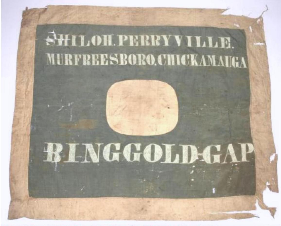
Hardee/Cleburne 1864 (Type 1) Battle Flag Issued to the 32nd & 45th Mississippi Volunteer Infantry Regiment (Field Consolidated)