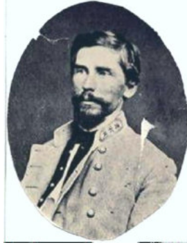
General Patrick R. Cleburne