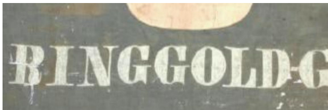
32nd & 45th Mississippi Infantry Regiment (Consolidated)