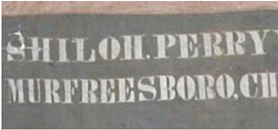
32nd & 45th Mississippi Infantry Regiment (Consolidated)