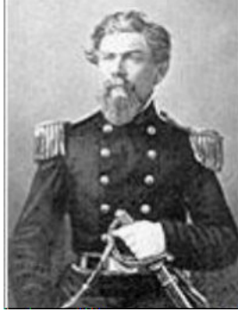
General William J. Hardee

Introduction - This Hardee/Cleburne 1864 (Type 1) pattern battle flag's provenance and history is at the top of the "Who's Who – What's What" list of Army of Tennessee regimental banners issued in the Western Theater of America's War of the Rebellion!! It was carried at the front of one of Mississippi's most famous regiments whose antecedent units fought in numerous major battles under the direct orders of Confederate leaders such as Lieutenant General William Joseph Hardee, Major General Patrick Ronayne Cleburne and Brigadier General Mark Perrin Lowrey; also generals Albert Sidney Johnston, P.G.T. Beauregard, Braxton Bragg, Joseph E. Johnston, John Bell Hood, Simon Bolivar Buckner and Sterling Alexander Martin "S.A.M." Wood.