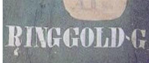
33rd Alabama Infantry Regiment

The “Roman style” block letters of the battle honors of the 32 nd & 45 th Mississippi (Consolidated) flag and the 33 rd Alabama flag were first outlined with the use of a stencil, and then hand painted. The conclusive proof in support of this is the style of the double G’s of “RINGGOLD-GAP” – both have the identical indentations in the bottom of these double G’s, the left one being deeper than the right one on both of these regimental flags. It was probably not uncommon for the brigade to have a painter for all of the flags in