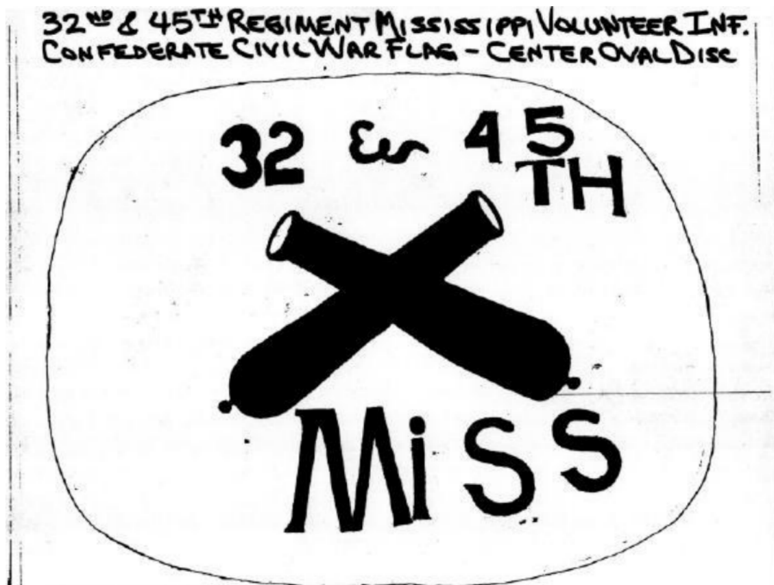
Rectilinear Moon of 32nd & 45th Mississippi Infantry Regiment (Consolidated) (Copyrighted: 2002, 2003, 2004, 2005, 2006)