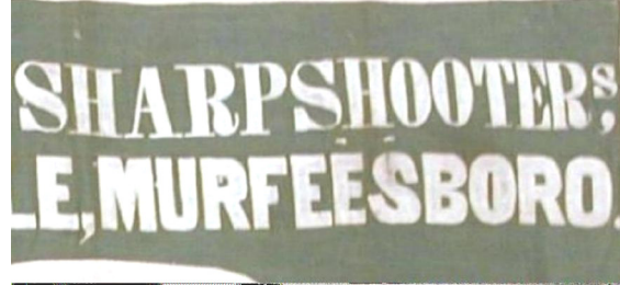
15th Mississippi Battalion Sharpshooters (Hawkins)