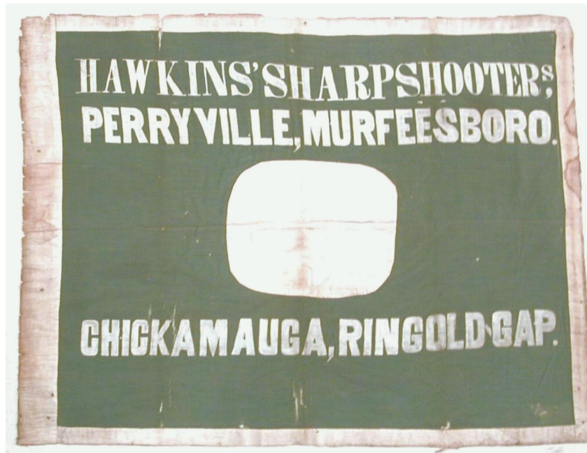
15th Mississippi Battalion Sharpshooters

The construction of the 32 nd & 45 th Mississippi (Consolidated) flag is a combination of off-white cotton fabric and blue/green cotton and wool blend fabric in the pattern of a Hardee/Cleburne Confederate Regimental flag. The leading edge has an off-white cotton pole sleeve. This Hardee pattern flag measures 36" on the leading edge and 42 3/4" on the fly, and was hand sewn throughout. A 9 1/2" by 11 3/4" off-white cotton disc, referred to as a "rectilinear moon," was appliquéd to each side of the fly. This rectilinear moon originally had a design that was hand applied in black very similar to the drawing below on the obverse side and has been well documented by the use of special photographic techniques. The fly has three rows of lettering, all applied with a white pigment to the obverse in Roman style. This flag is intact overall except for minor fabric loss at the top of the pole sleeve and top and bottom of the fly end. There is also some very light staining